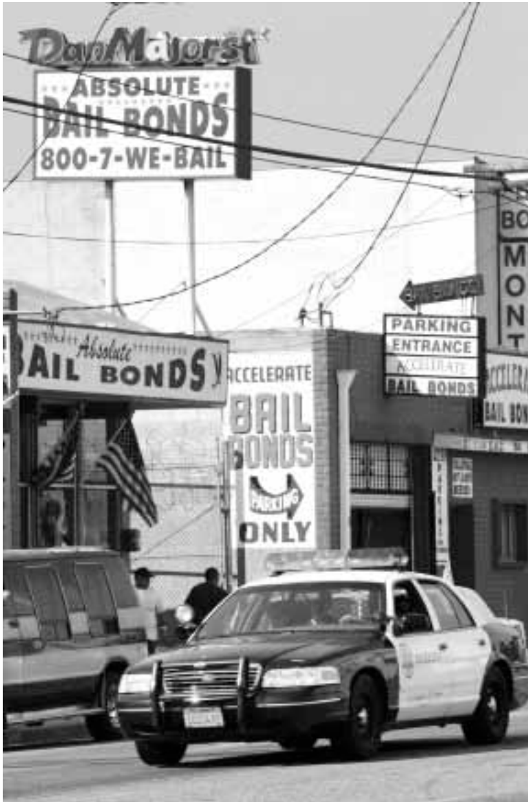
Bail bond agents cater to captive customers near Los Angeles's 5,000-inmate Men's Central facility.

favor of releasing defendants on their own recognizance.